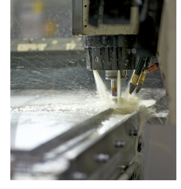
The OEM standard is a matter of course of us. We demand precision.