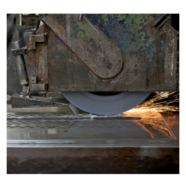
Experience. Know-how. Development. The three pillars for proficiency and success.

For decades, C.A.PICARD® has been counted among the world's best manufacturers of wear parts for specialist industries. Our knowledge of materials is based on our history - since the founding of our company in 1876, we have been ideally combining experience, know-how and development. The requirements on our production have ensured our on-going development. Our highly-qualified employees use state-of-the-art machining procedures. The results speak for themselves: We produce precise and highly wearresistant parts and equipment, which meet the highest of demands.